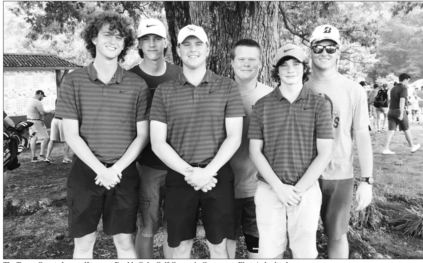
The Towns County boys golf team at Double Oaks Golf Course in Commerce.

Indians shooting in the 70's both days, while battling against the